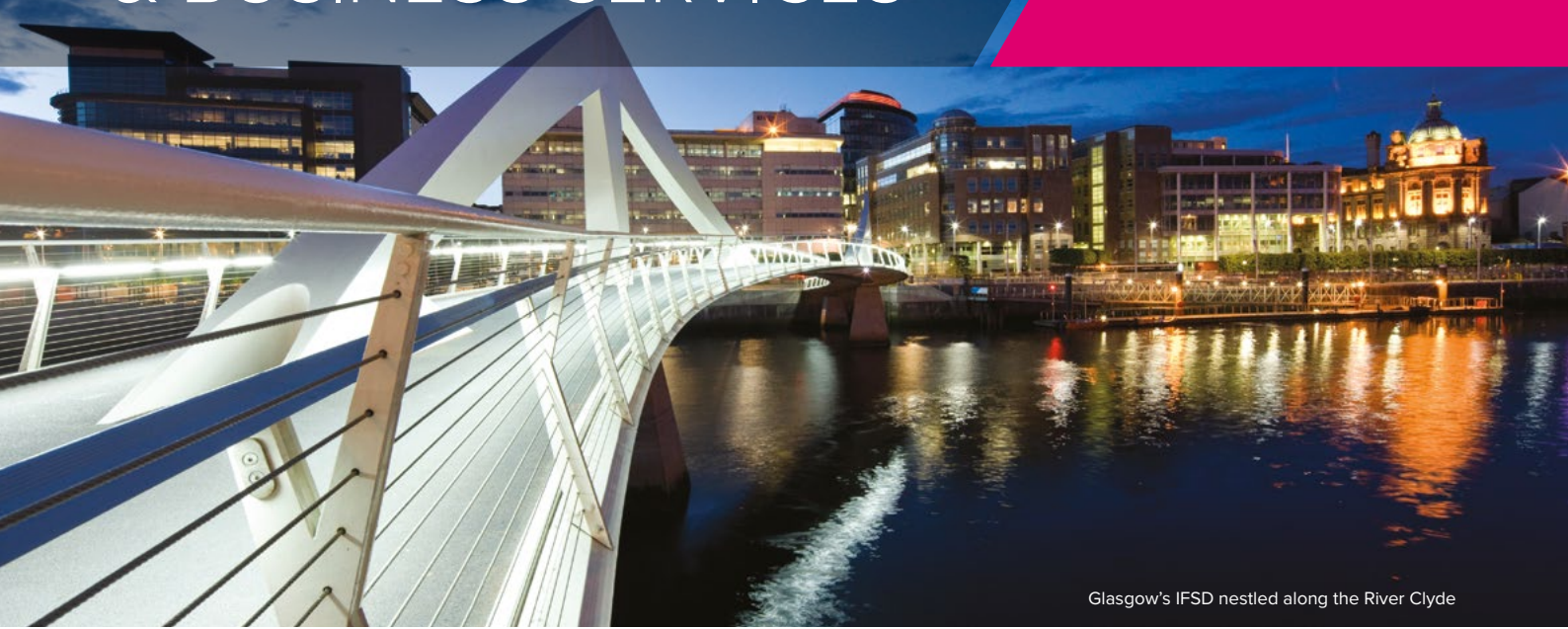
Glasgow's IFSD nestled along the River Clyde